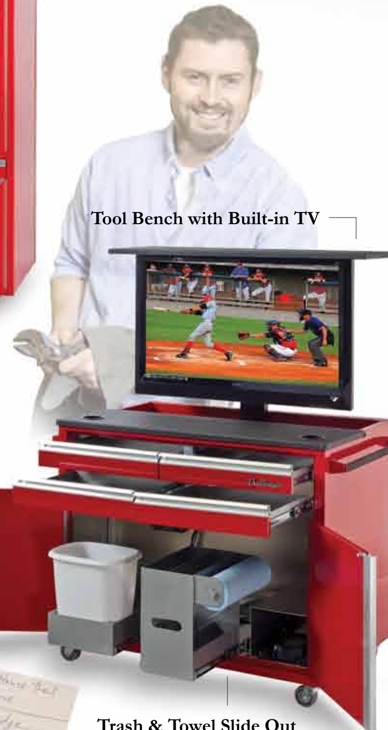
Trash & Towel Slide Out