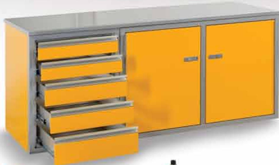
Rolling Work Bench