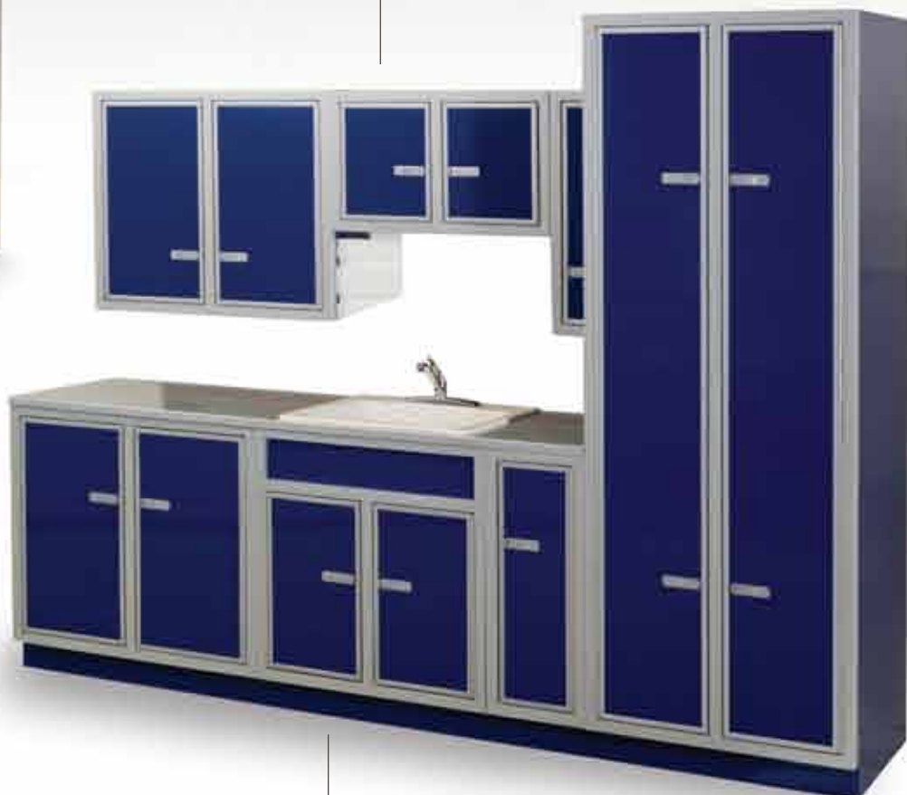
Sink & Storage