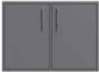
Double Door 30", 36" and 40" Adjustable shelf