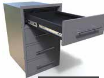
Grey Glimmer Cabinet

Available as full enclosures or as door and frame only, we've created a durable kitchen storage unit that is ready to install when it arrives at your door.