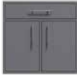
Double Combo 30", 36" and 40" Adjustable shelf