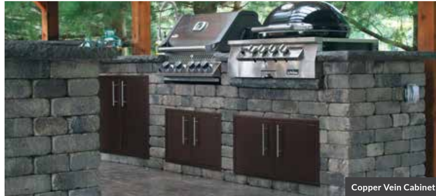
Copper Vein Cabinet