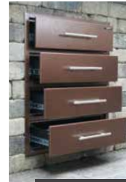
Copper Vein Cabinet