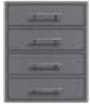
Four Drawer 18" and 24" Full extension drawers