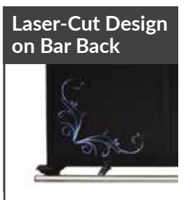
Optional LED Lights behind design available.

Comes in 304 Stainless Steel or Powder-Coated Aluminum.