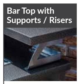
See countertop colors for avaialbe options.