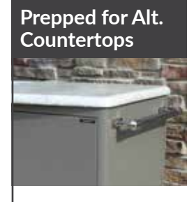
Cabinets are ready for countertop surface of your choice.

Portable system for water where plumbing is absent.