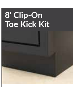
Provides a finished, sleek look. Keeps dust and dirt from under cabinetry.