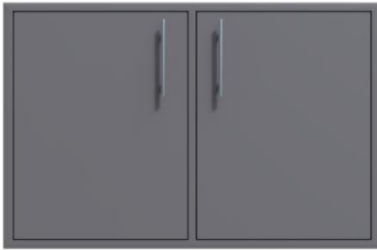
2 Door (LH/RH) Full Width Adjustable Shelf in Full Enclosure