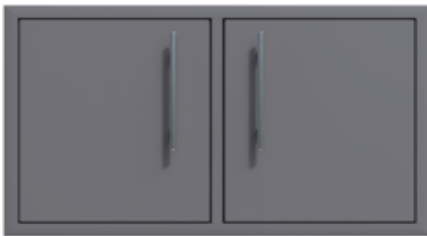
2 Door (LH/RH)