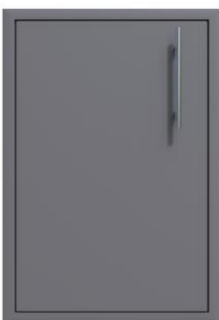
1 Door (LH or RH) Full Width Adjustable Shelf in Full Enclosure