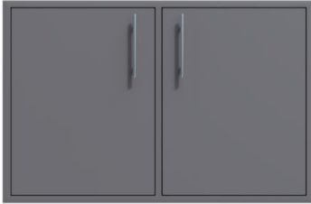
2 Door (LH/RH) Full Width Adjustable Shelf in Full Enclosure