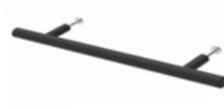
Black Stainless Steel Pull