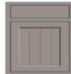
Ribbed Shaker Door